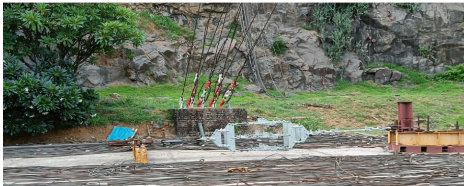
TESTING OF QUAD TENSION STRING HARDWARE